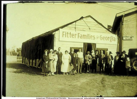
American Philosophical Society. Noncommercial, educational use only.